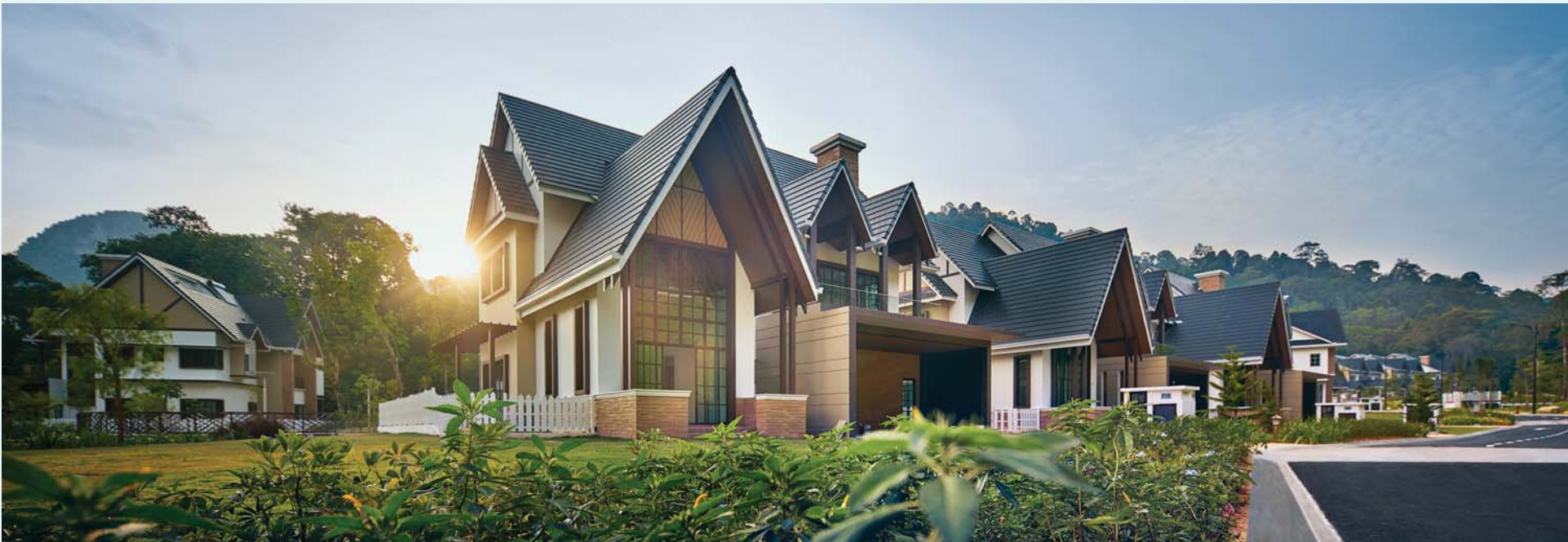
Top: The English-inspired homes of Essex Gardens are now a reality.