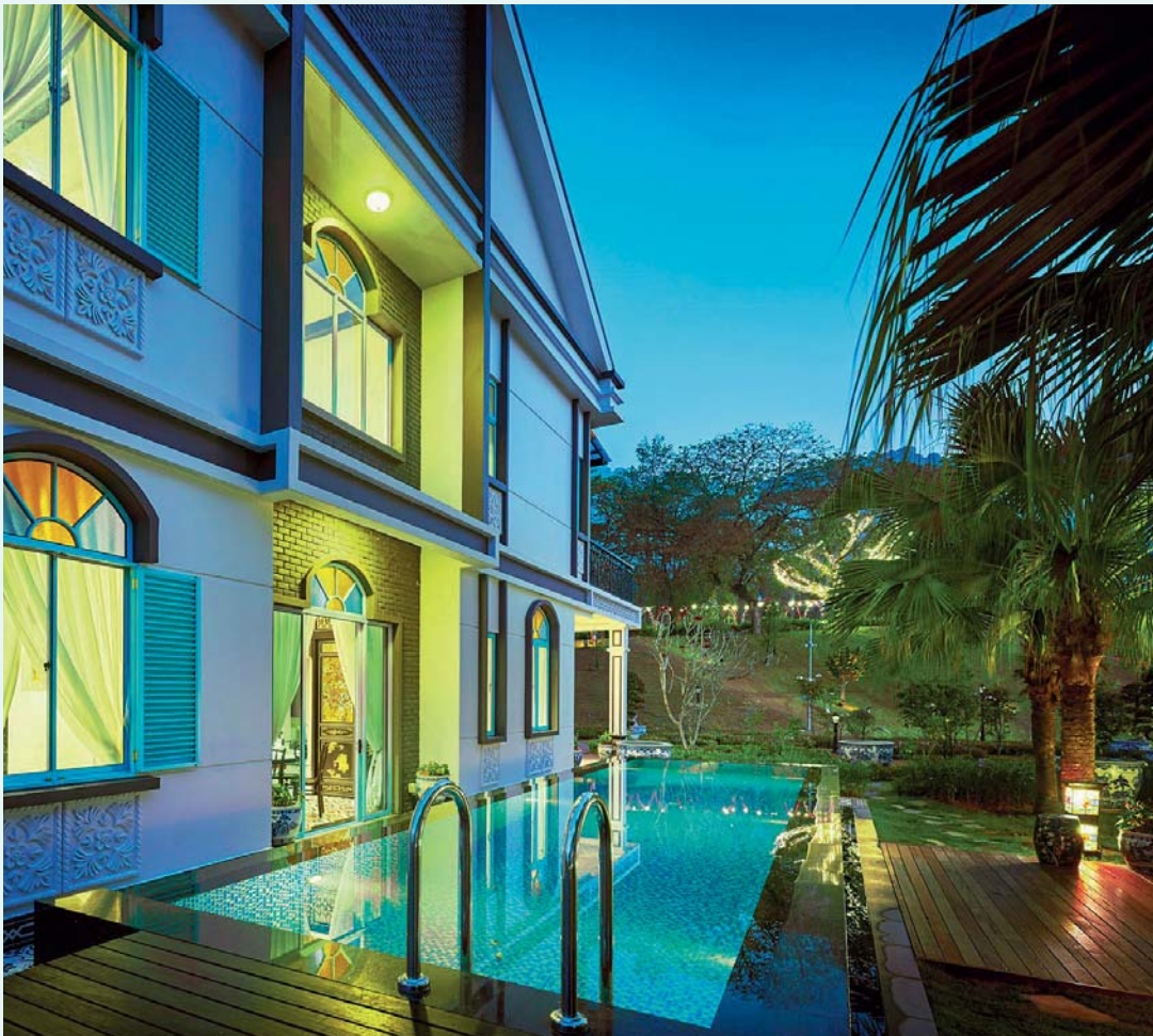
Peranakan-inspired design of the Peranakan Straits homes.