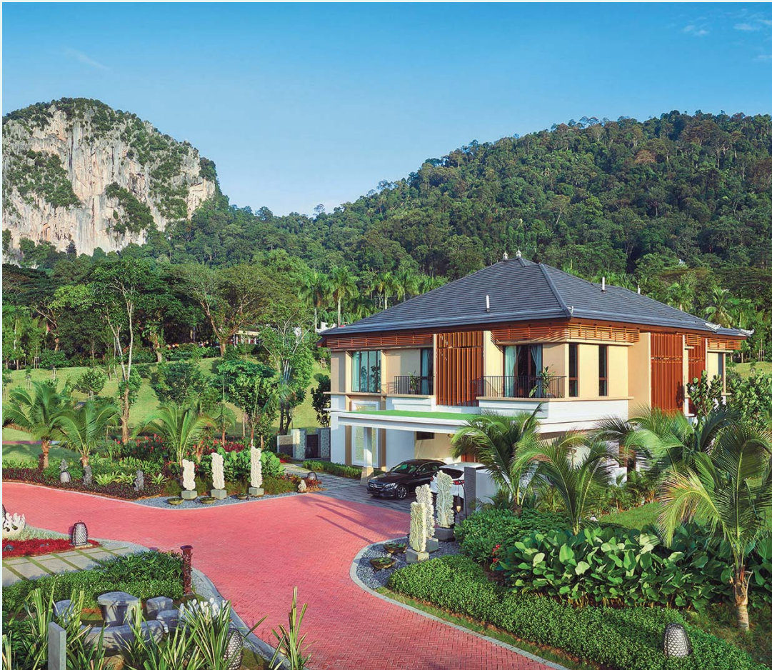
The majestic hills of Bukit Takun is just a stone's throw away from Setia Eco Templer.

The Grove @ Templer is the exclusive commercial property in the township.