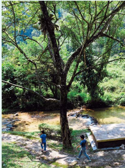
Above: Templer Park or Taman Rimba Templer is known as the green lung of Rawang.

One could enjoy the morning mist, fresh air and waterfalls while engaging in jungle trekking, camping and other activities in and around Templer Park. Here are some places to go and things to do there.