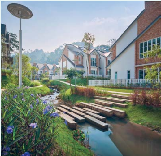
Right: Setia Eco Templer was planned and built around a natural setting such as the natural creeks that flow from the forest reserve.