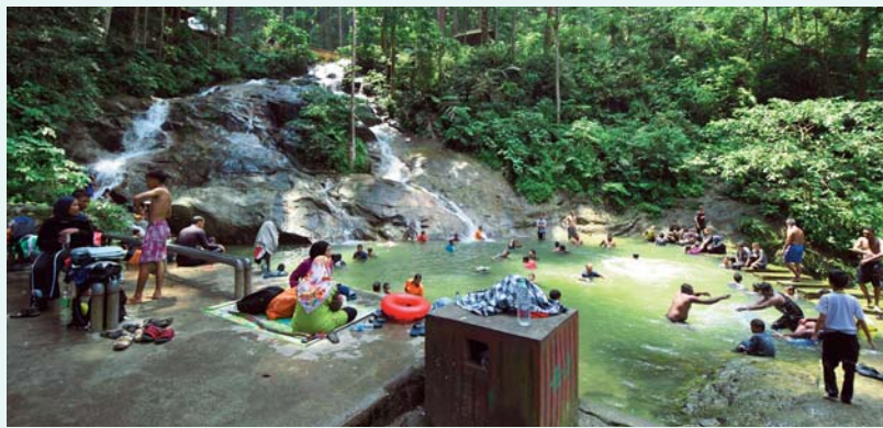
Left: The waterfalls at Kanching Eco-Forest Park is a popular picnic spot.