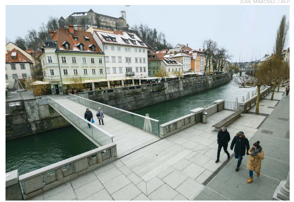
Slovenia tops the global house price index for the first time.

"The Chinese Mainland crept back up the rankings, whilst Finland and Sweden headed south. We reported last quarter on rising prices in Central and Eastern