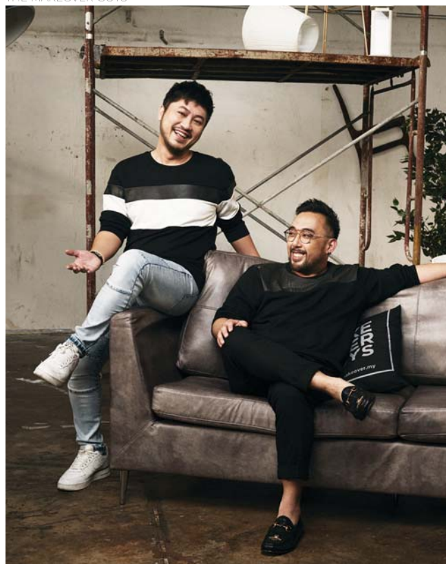
THE MAKEOVER GUYS

the market for sale for some time but failed to attract buyers.