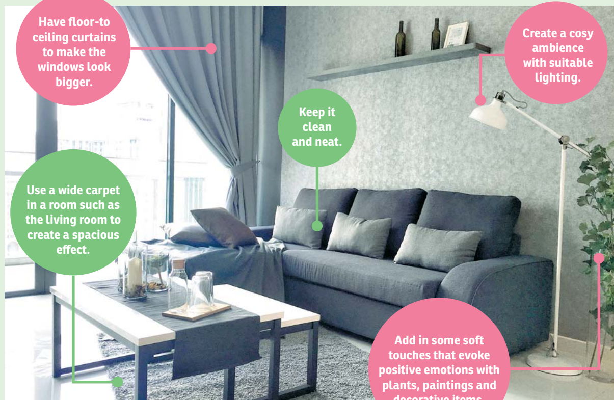
An Airbnb unit designed by Ingenious Makeover.

Add in some soft touches that evoke positive emotions with plants, paintings and decorative items.