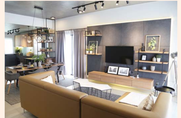
Baccas provides residents with an optimal layout and an open floor plan.

The show unit is fitted out with building materials from Lafarge Malaysia, paint from Nippon Paint Malaysia and home appliances from Panasonic Malaysia.