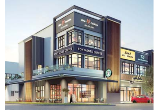
An artist's impression of Setia Fontaines' shoplots.

Setia EcoHill 2 has also recently introduced the Baccas Collection. The double-storey terraced houses have been designed and will be built based on findings from the Lafarge-EdgeProp MYHOME survey initiated by Lafarge Malaysia and EdgeProp.my. The survey was conducted from Feb 28 to April 15 to find out what Malaysians want acre park. It will be developed based on SP