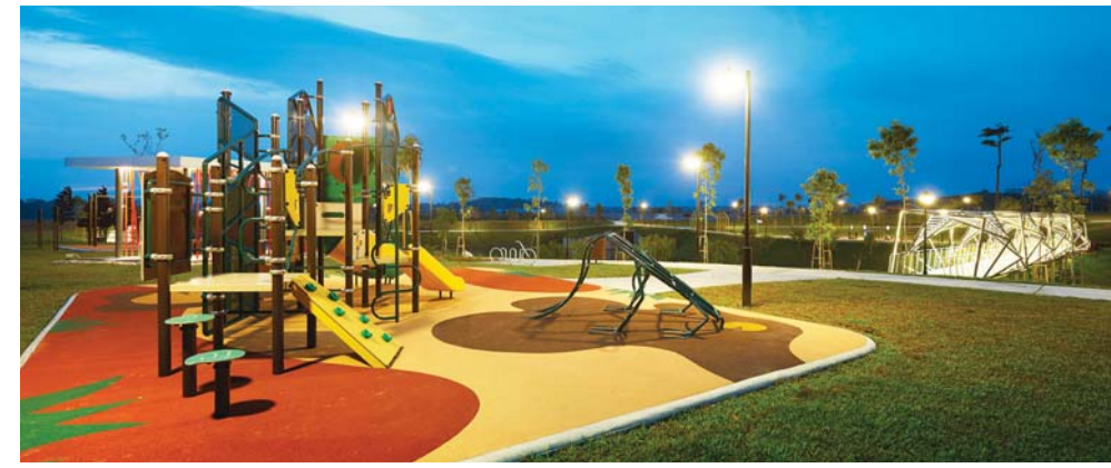
The South Creek Children Playground for young families to spend time at.

er factors that Malaysians prioritise when choosing a home is convenient location (74.1%) and good security (71.8%).