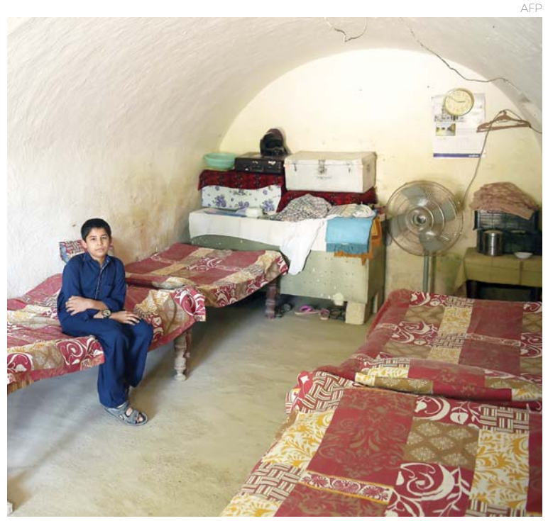
A young Pakistani villager sits in a cave room in Nikko village, about 60km from the capital Islamabad.