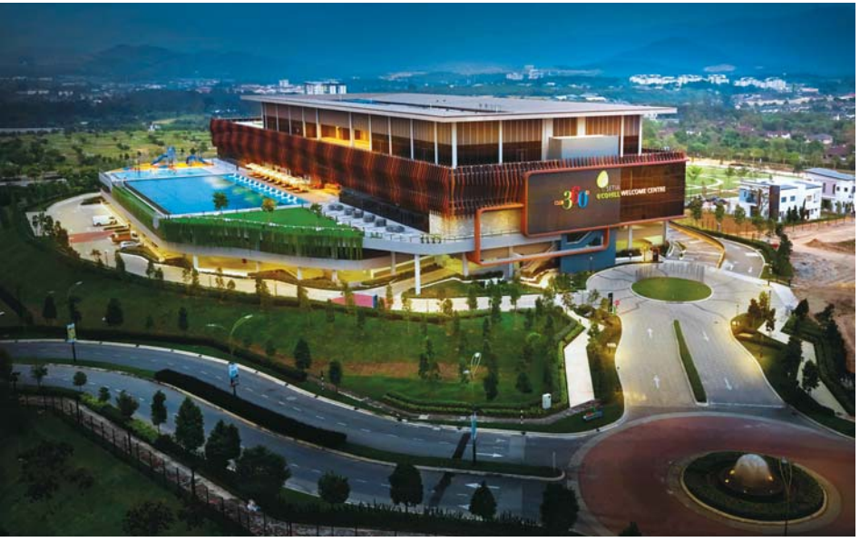
Club 360 provides many kinds of facilities including swimming pools and gym exclusively for the residents of Setia EcoHill and Setia EcoHill 2.