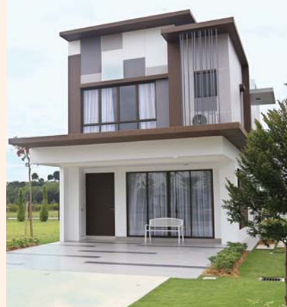
The Baccas show unit.