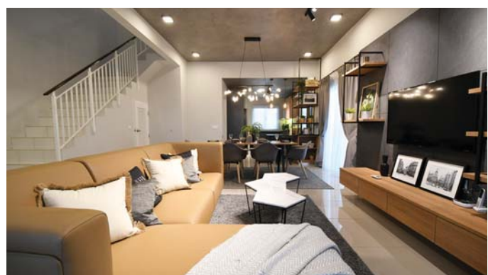
Top and left: The interior of the Baccas show unit features an optimal layout with an open floor plan.