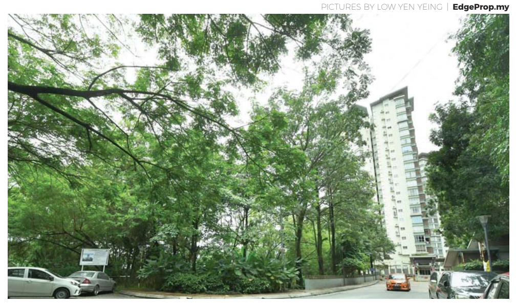
Wangsa Maju development, comprising The site of the upcoming development is located about 100m away from Desa

has not responded to their letter, nor to their surrounded by lots of high-density develop-