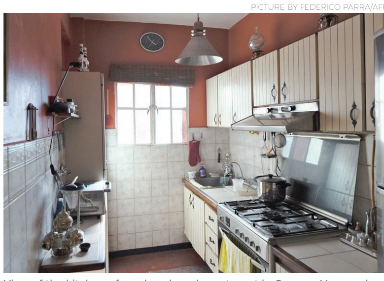
View of the kitchen of an abandoned apartment in Caracas, Venezuela

When the couple left Venezuela, they simply locked the doors to the apartment rather than selling it, even though the money would