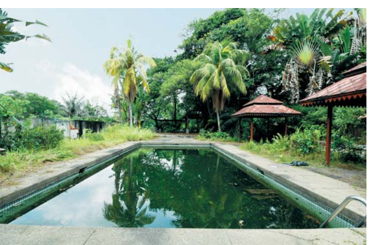
The site of the abandoned swimming pool is where Tan hopes a peace hotel can be built.

Carcosa Seri Negara's condition was worse than Tan had imagined, but he believes this is the place to realise his dream of building a themed museum to promote the concept of peace.