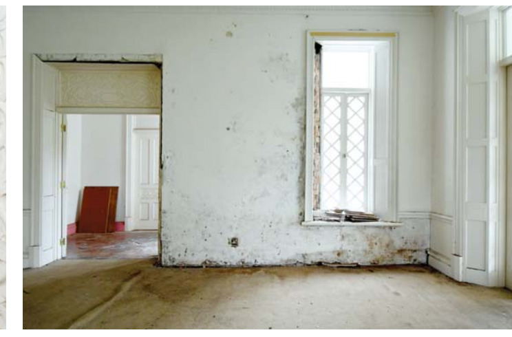
One of the empty rooms in Carcosa.