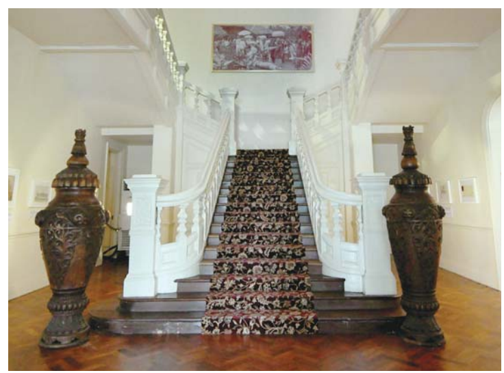
The grand staircase in Carcosa which was featured in the movie Crazy Rich Asians

One of the corridors on the ground floor of Seri Negara.