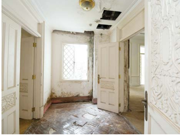
The current condition of Carcosa's interiors.