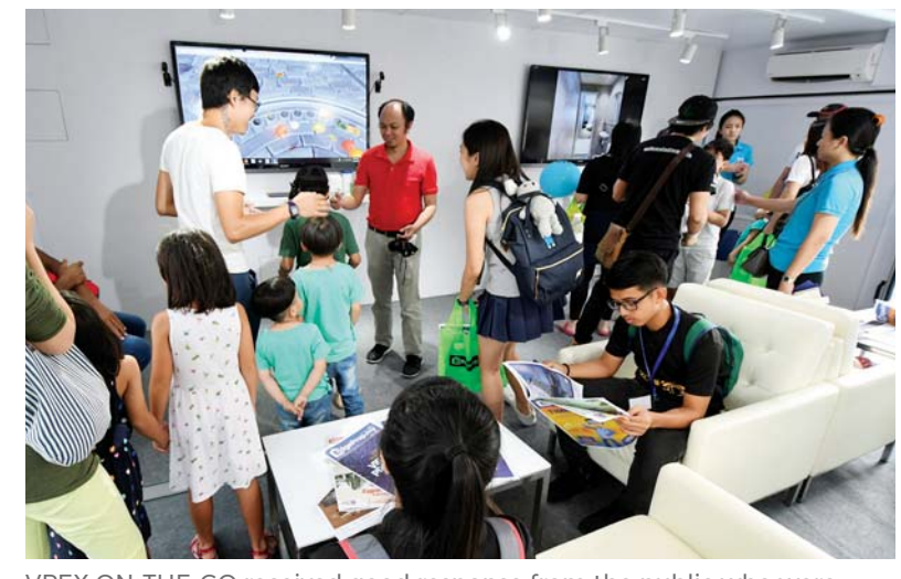
VPEX ON-THE-GO received good response from the public who were eager to experience virtual tours of the properties.

While you may have missed out on VPEX-ON-THE-GO, VPEX is still ongoing until July 29 at VPEX.EdgeProp.my.