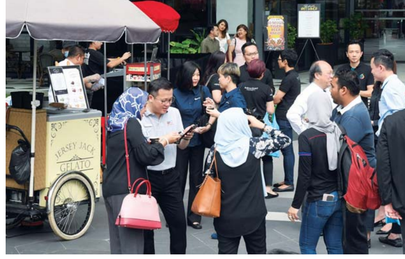
ders are supporting sponsors of VPEX 2018. Ice-cream and popcorn were available for free to VPEX ON-THE-GO visitors.