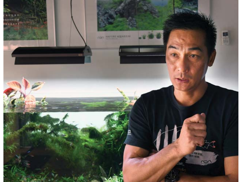
Chan: It can actually last forever with some regular maintenance.