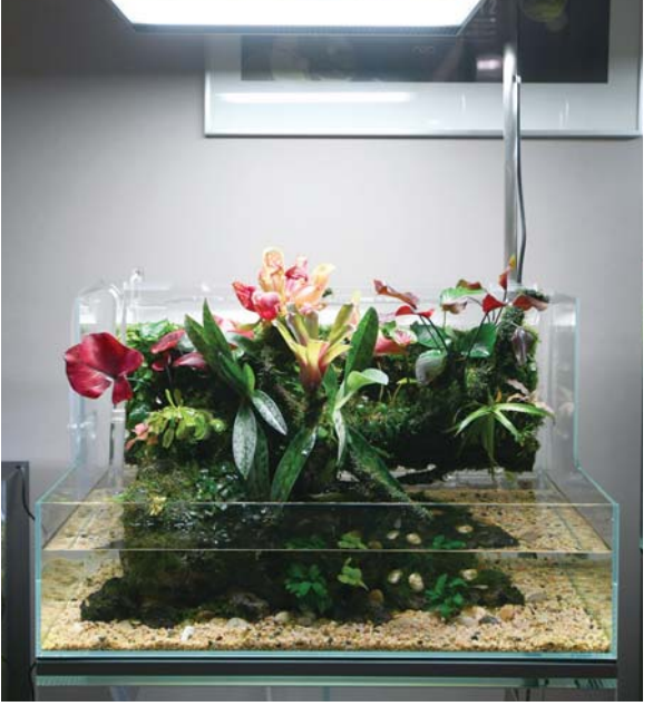
A mini jungle you can have at home.