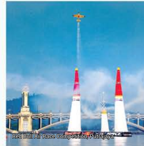
Red Bull Air Race Competition, Putrajaya

Enjoy the adrenaline pumping air race or the joy of riding a horse in the equestrian park.