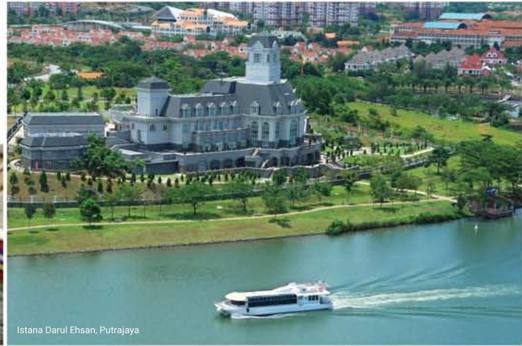
Istana Darul Ehsan, Putrajaya