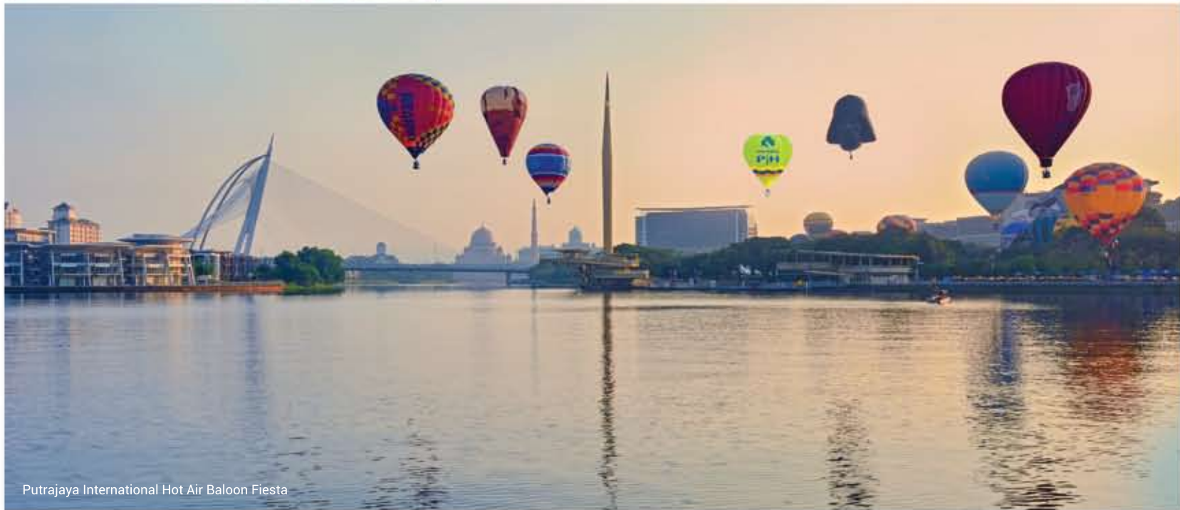
Putrajaya International Hot Air Balloon Fiesta