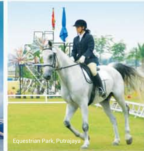
Equestrian Park, Putrajaya