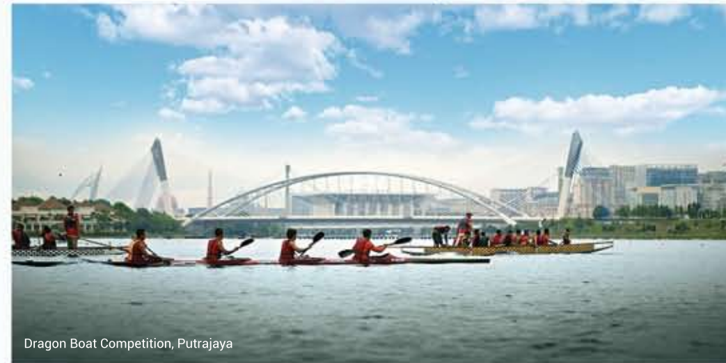
Dragon Boat Competition, Putrajaya

Colourful hot air balloons with creative shapes and designs take to the skies over Putrajaya every year during the Putrajaya International Hot Air Balloon Fiesta. Other yearly activities such as the Malaysia International Dragon Boat Championship and Putrajaya International Fireworks Competition a unique experience for everyone.