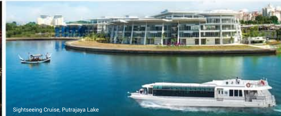
Sightseeing Cruise, Putrajaya Lake