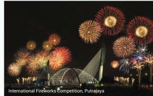
International Fireworks Competition, Putrajaya